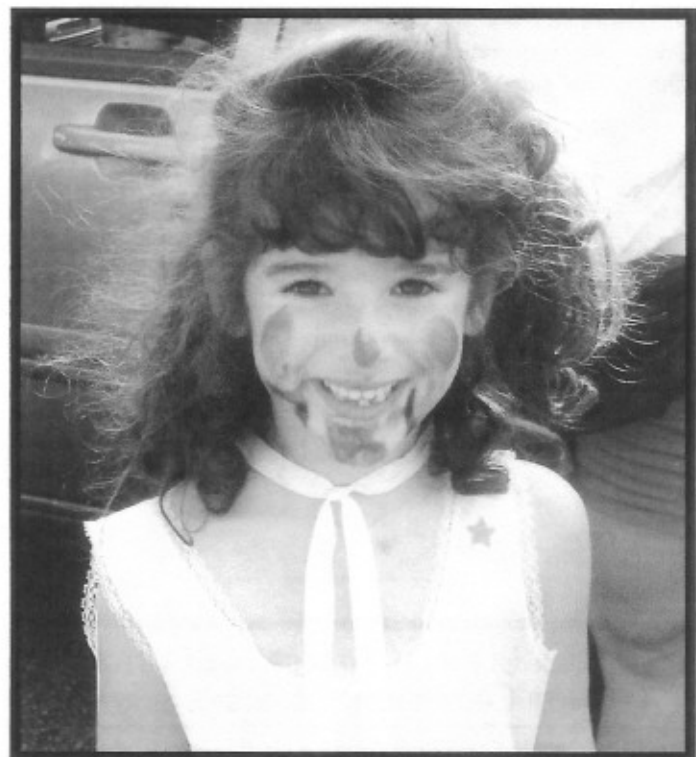
Lionheart offers acting opportunities for the young and old.