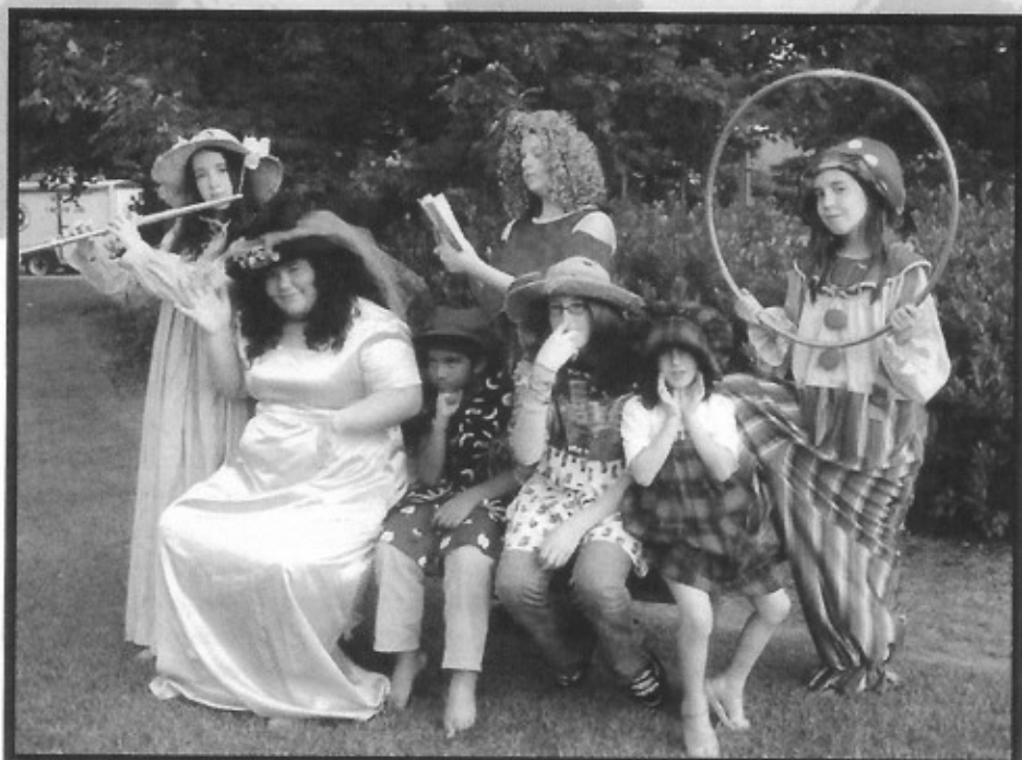
Max Lucado's "You Are Special" was the talk of the town when it was staged before the Norcross Fourth of July fireworks.

It is 6:30 on a Tuesday evening and Tanya Carroll is jangling a huge set of keys in hand as she jumps out of her minivan. This Norcross mother ushers herself to the front doors of the Norcross Presbyterian Church. Parents and children eagerly file behind her to enter a darkened reception area. She flips on the fluorescent lights to reveal a church lobby festooned with flyers and memorabilia. Posters of upcoming events line the cinderblock walls. Stacks of bibles rest neatly on tables. A letter from a church member who is serving overseas catches the eye; reminding those who choose to view it, that there is indeed a war being waged on the other side of the world.